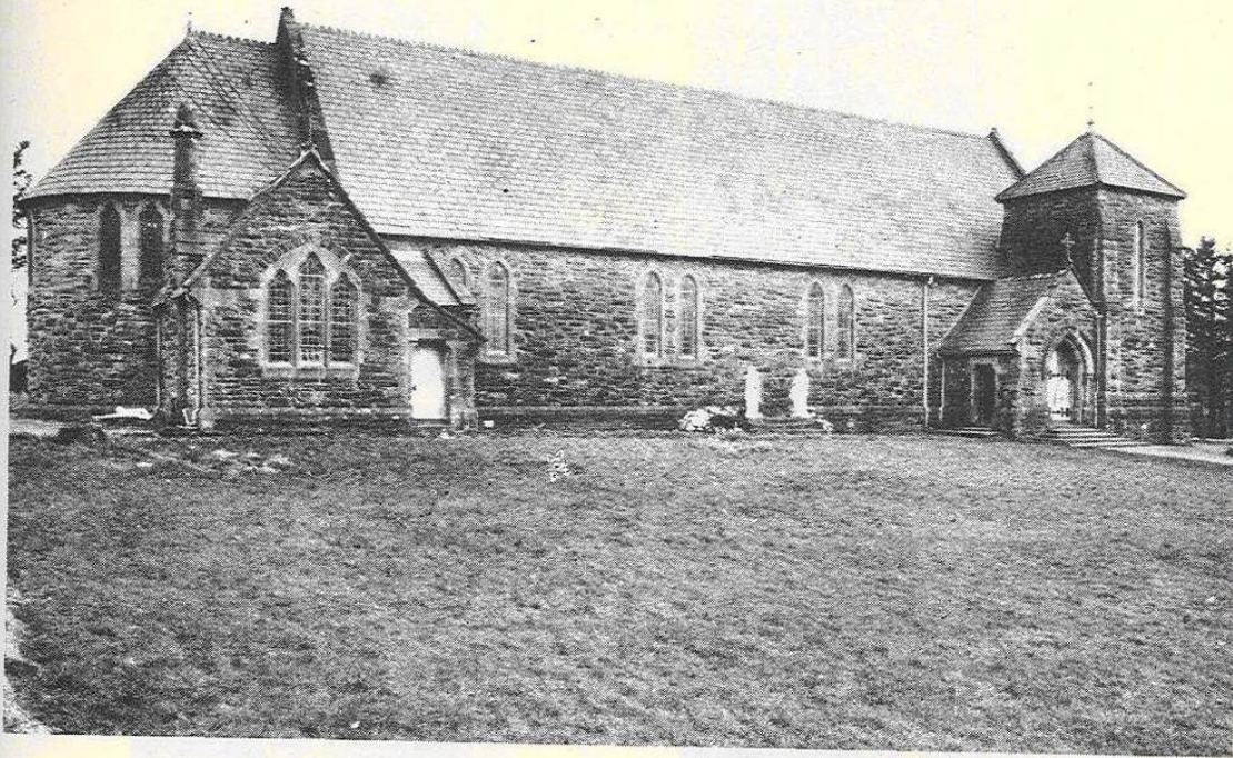
Teach Phobail Naomh Fionáin, An Falcarrach; 1879 – 1980